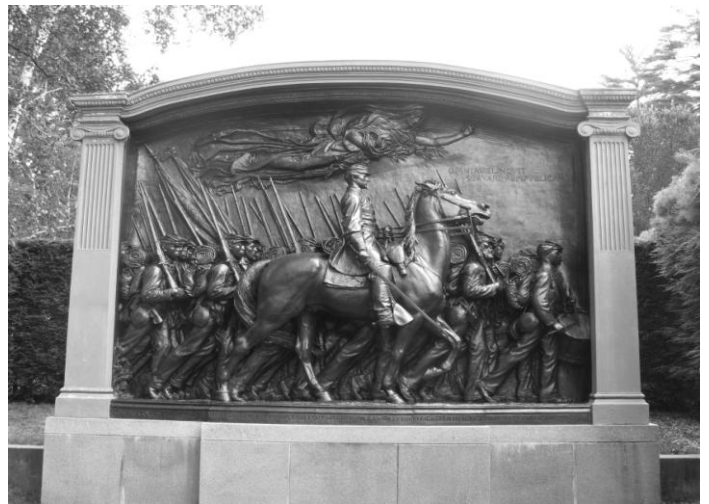
SAINT-GAUDENS CIVIL WAR MONUMENT, Cornish, NH: Duplicate of original commissioned to sculptor, Augustus Saint-Gaudens, by Boston, MA, to commemorate Black Civil War unit which fought valiantly in conflict.